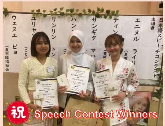
Speech Contest Winners

Additionally, locals experienced the “Easy Japanese Class” which is held for union members everyday. In the evening, everyone deepened exchange while enjoying the barbecue. Thank you to everyone who participated.