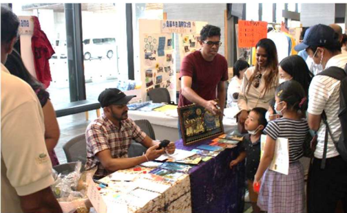
Nagasaki Lanka Nakama

*JICA Desk Nagasaki, Nagasaki Prefectural Volunteer Activity Support Center, The Japan-Netherlands Society of Nagasaki, Association of Vietnamese in Nagasaki, Students International NGO BOAT