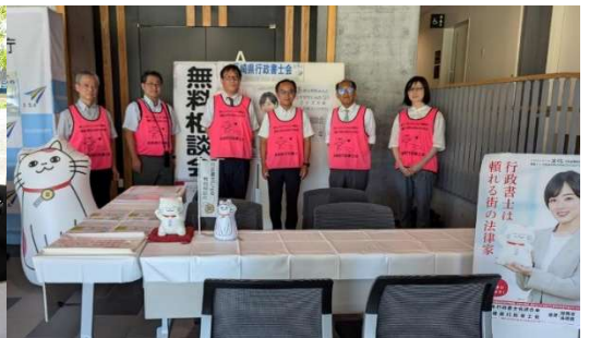
The consultation booth by Nagasaki Certified Administrative Procedures Legal Specialists Association