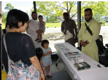
Nagasaki Islamic Centre